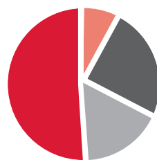
Snapshot: Nationality breakdown for ALL courses at all centres